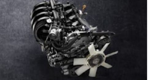
2.5 PDTI INTERCOOLED TURBO DIESEL ENGINE