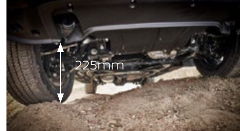
ELECTRONIC LOCKING REAR DIFFERENTIAL

Going off-road? You'll need more grip. The TERRA's On The Fly 4X4 system allows you to instantly switch between efficient 2WD and the powerful 4Hl. Navigate obstacles, deep sand, snow, mud, or you daily roads with ease.