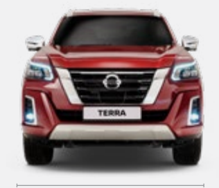
1 870 mm